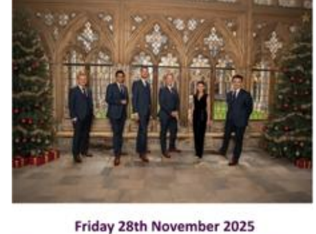
Tickets and Further Details from Cranleigh Arts Box Office

MY CRANLEIGH is a new website that has which has been created by volunteers to explore and share memories of Cranleigh life, past and present. There is lots of information on there, including an article